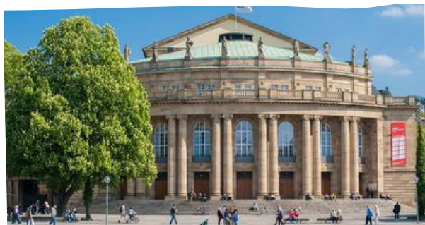
STAATSOPER STUTT GART