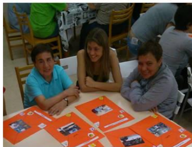
COMUNITAT ELS AVETS - Moià